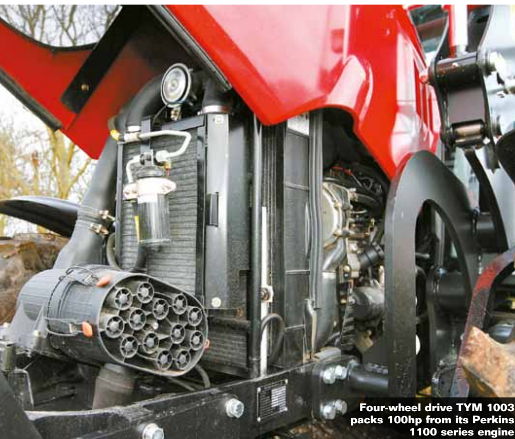
Four-wheel drive TYM 1003 packs 100hp from its Perkins 1100 series engine

And PTO control can be brought into this equation too – all of which add up to useful savings in time and effort when it comes to field work.